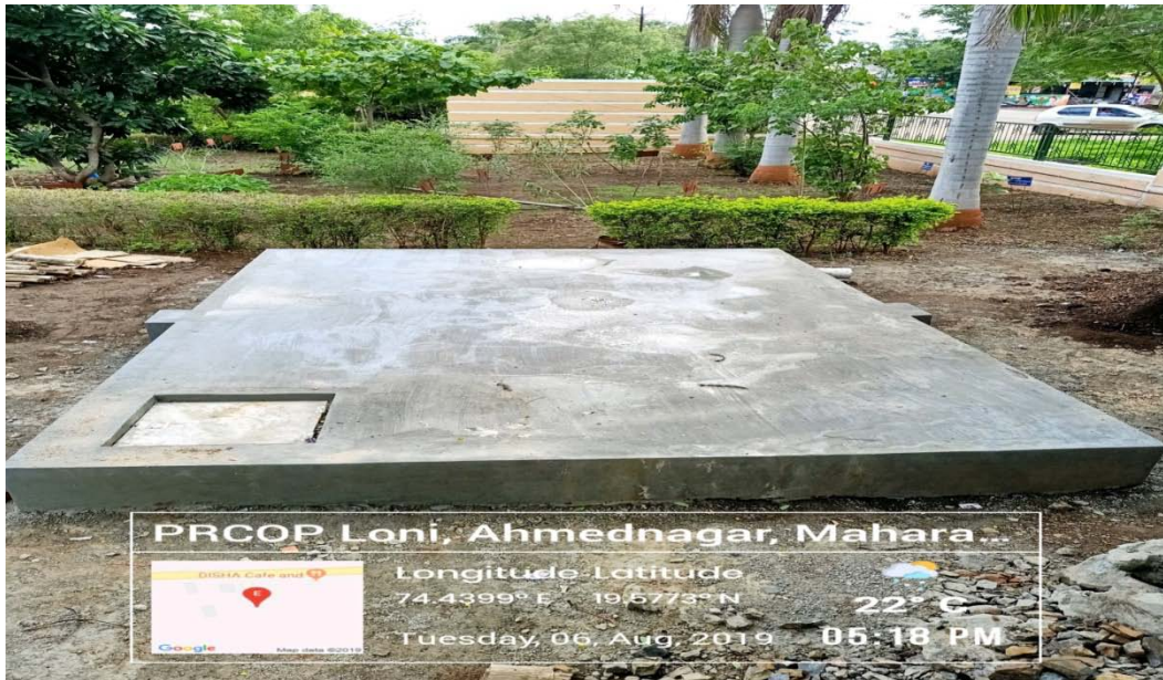
Rain Water Harvesting facility

PRAVARA RURAL EDUCATION SOCIETY'S PRAVARA RURAL COLLEGE OF PHARMACY LONI