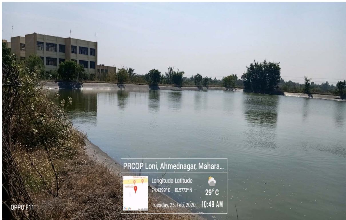
Centralised water reservoir