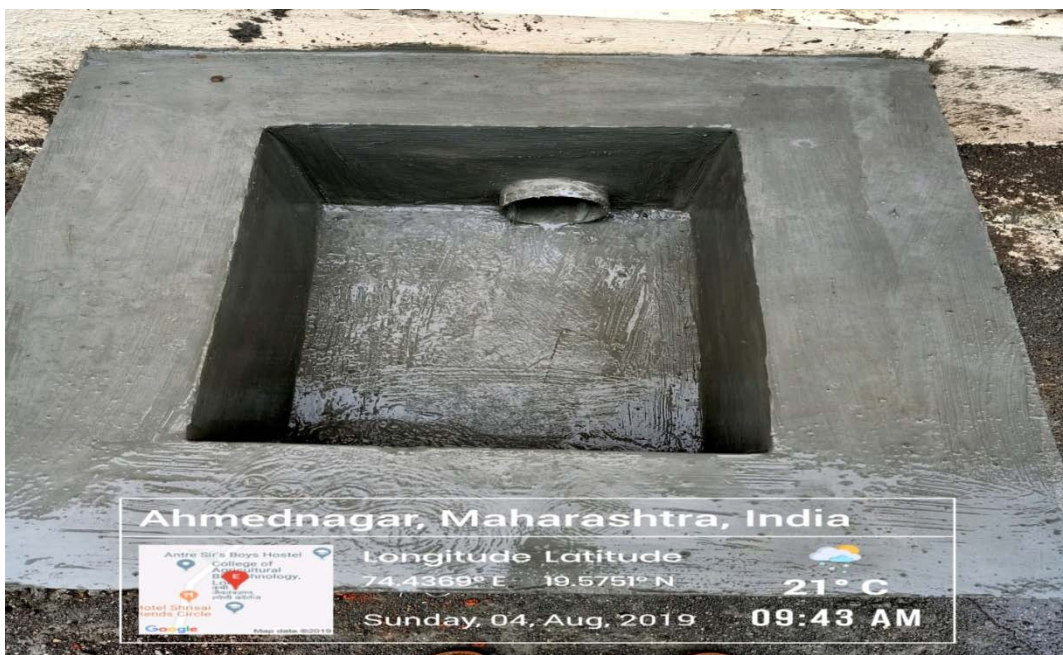
Rainwater recharge from rooftop