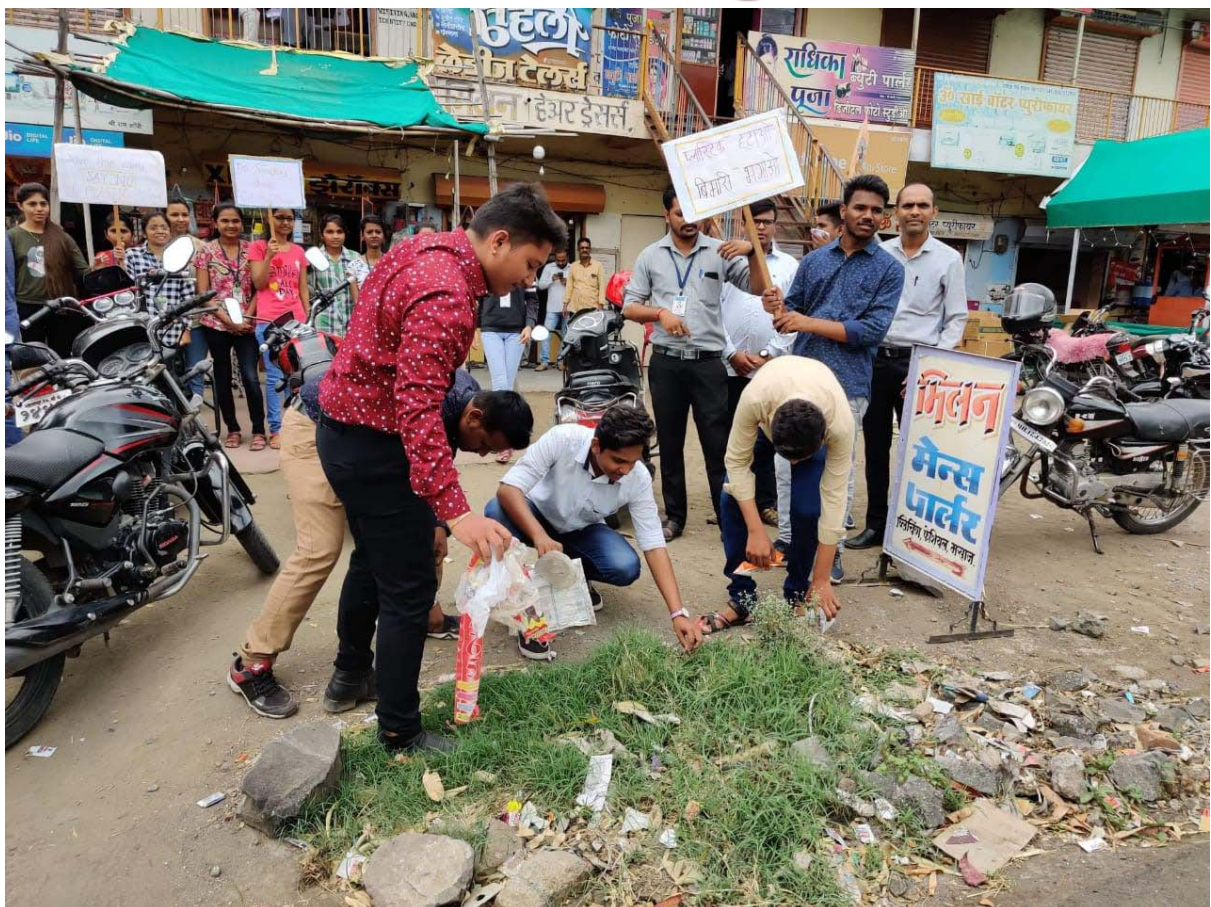
Collection of plastic waste during the rally

PRAVARA RURAL EDUCATION SOCIETY'S PRAVARA RURAL COLLEGE OF PHARMACY