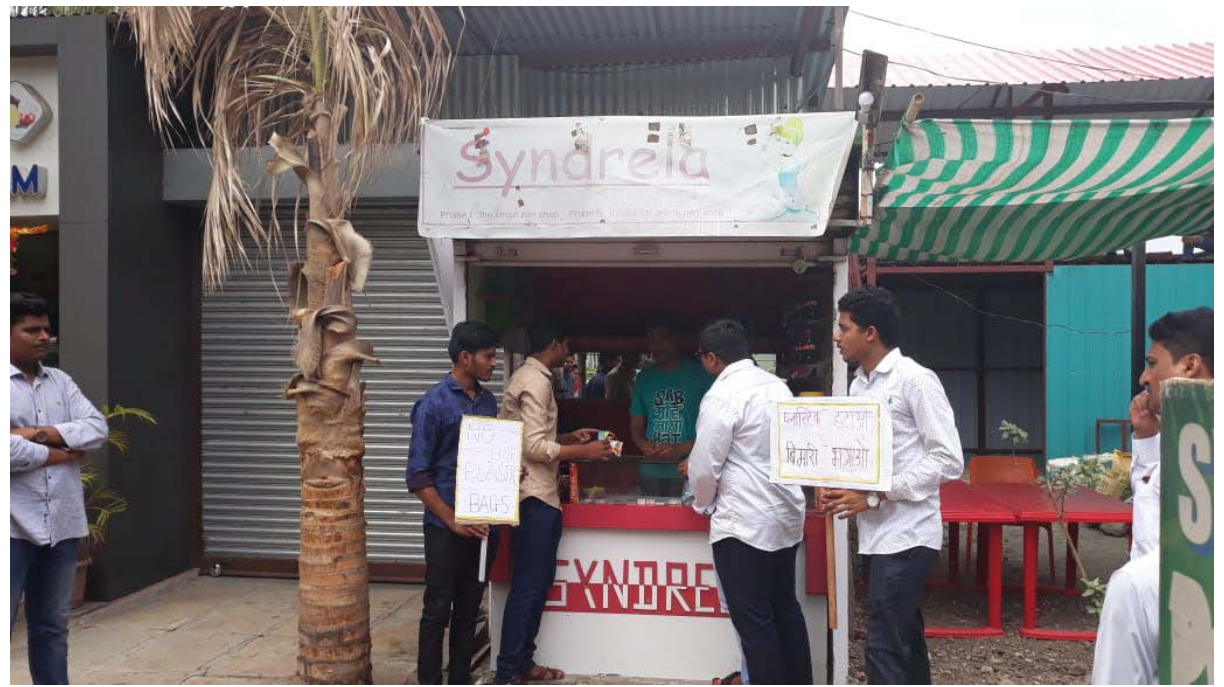
Sensitizing the public regarding harmful effects of Plastic use