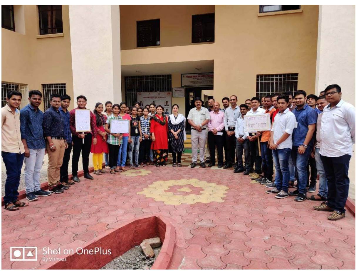
Plastic awareness rally with placards

PRAVARA RURAL EDUCATION SOCIETY'S PRAVARA RURAL COLLEGE OF PHARMACY LONI