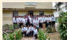
PREMIUM SERUM, NARAYANGAON SAHYADRI FARM, NASHIK