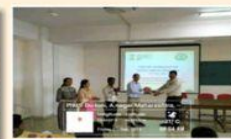
WORKSHOP ON GCP, PIMS LONI