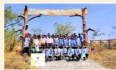
NATURE CENTRE, CHANDANAPURI